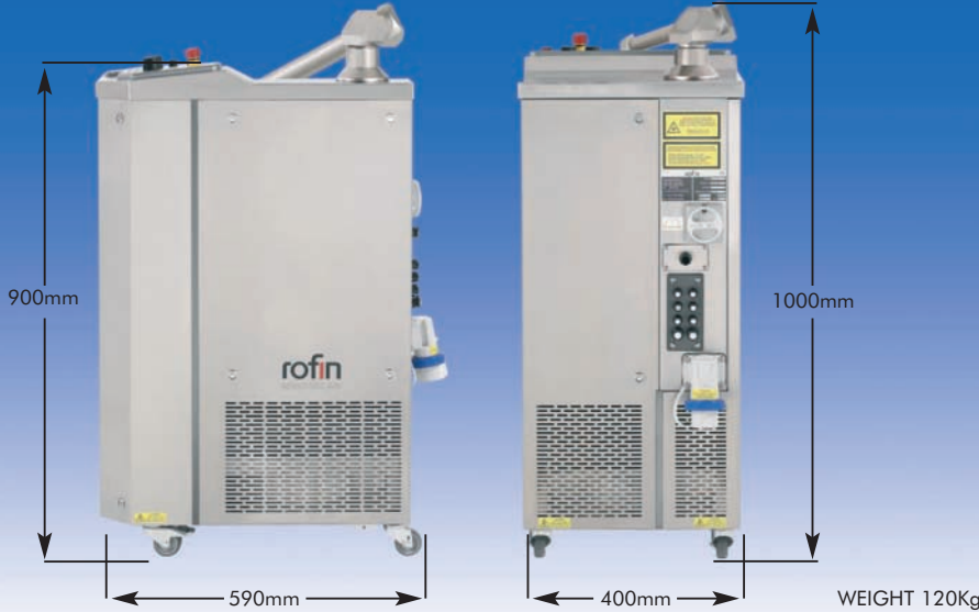
The Multiscan VS